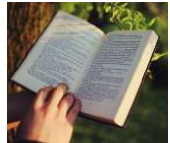
SPELD-SA Sound Bingo Set 5

Picture Key: (w) web, (ng) swing, (z) zebra, (v) vest, (v) vet, (ng) ring, (oo (book) ) hook, (w) windmill, (oo (moon) ) root, (z) zip, (oo (moon) ) boot, (oo (book) ) book.