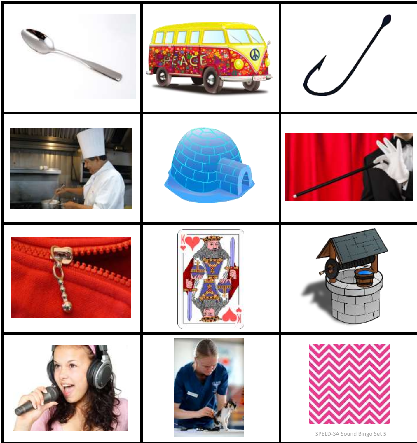
SPELD-SA Sound Bingo Set 5

Picture Key: (oo (moon) ) spoon, (v) van, (oo (book) ) hook, (oo (book) ) cook, (oo (moon) ) igloo, (w) wand, (z) zip, (ng) king, (w) well, (ng) sing, (v) vet, (z) zigzag.