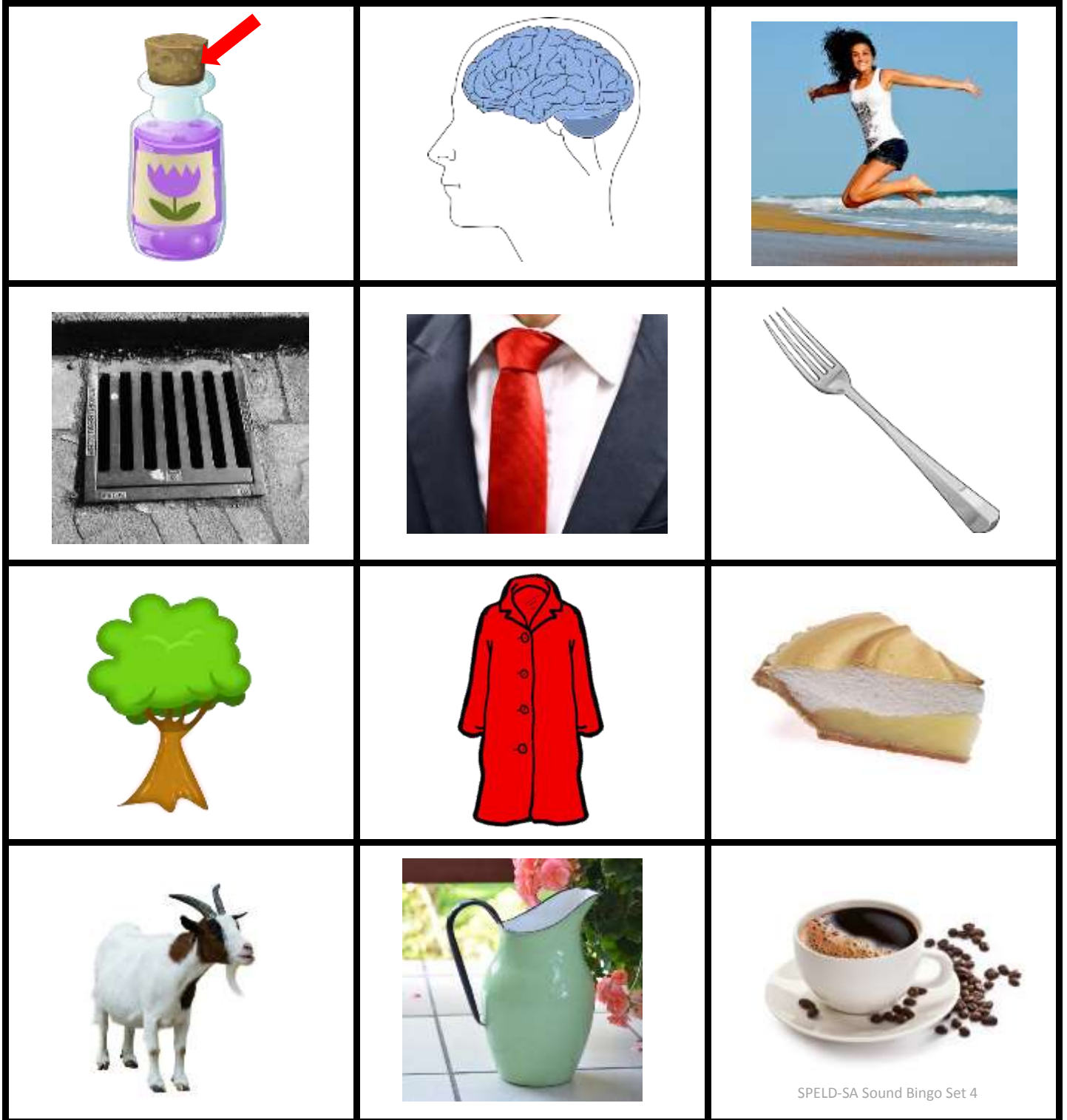
SPELD-SA Sound Bingo Set 4

Picture Key: (or) cork, (ai) brain, (j) jump, (ai) drain, (ie) tie, (or) fork, (ee) tree, (oa) coat, (ie) pie, (oa) goat, (j) jug, (ee) coffee.