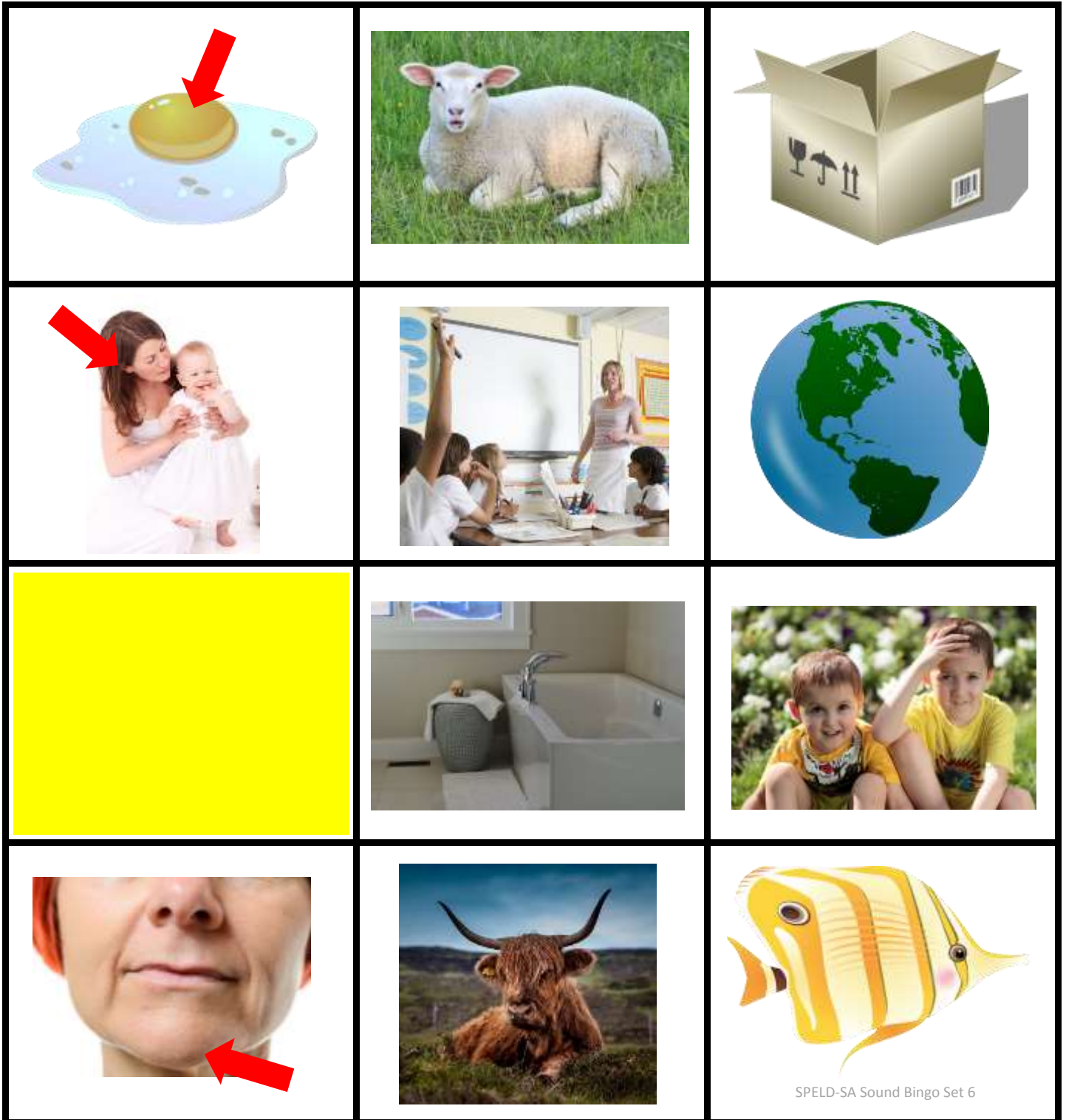
Picture Key Card 2: (y) yolk, (sh) sheep, (x) box, (th (that) ) mother, (ch) teacher, (th (think) ) earth, (y) yellow, (th (think) ) bath, (th (that) ) brothers, (ch) chin, (x) ox, (sh) fish.