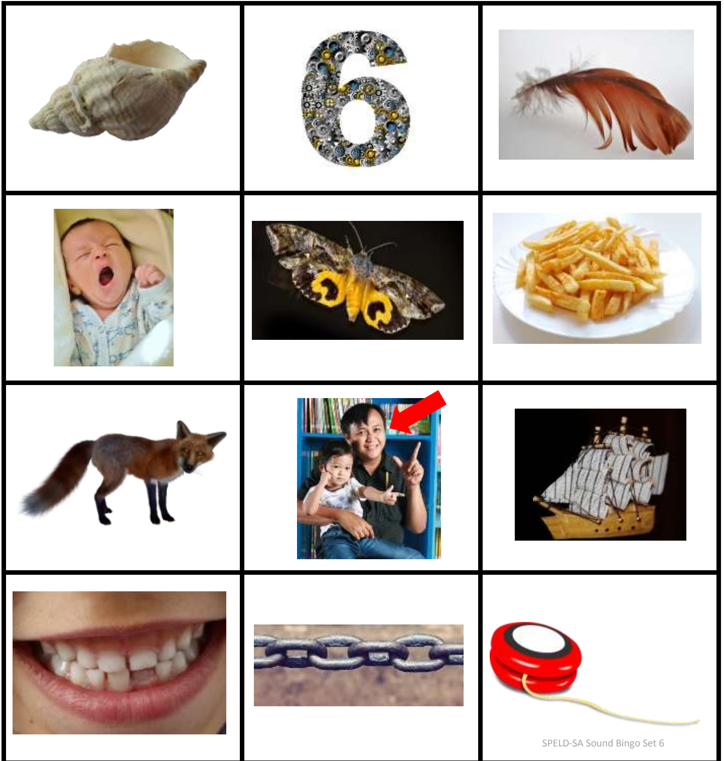
Picture Key Card 1: (sh) shell, (x) six, (th (that) ) feather, (y) yawn, (th (think) ) moth, (ch) chips, (x) fox, (th (that) ) father, (sh) ship, (th (think) ) teeth, (ch) chain, (y) yo-yo.